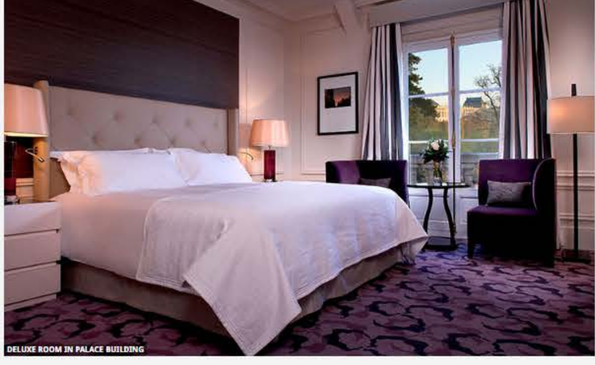
DELUXE ROOM IN PALACE BUILDING

A grandiose hotel dating back to 1907 all gleaming monochromatic tiled floors, chandeliers and vertiginous ceilings; its 199 rooms offer clean lines and contemporary décor with quirky touches, like the camouflage carpets. Trimmings range from the Nespresso machine to the large flat screen TV and a sublime bathroom, all grey marbles, monochromatic mosaic and best of all, a view of the chateau de Versailles from your bathtub! Not to mention a huge Guerlain Spa and pool.