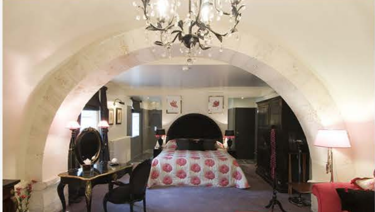
ABBAYE DE LA BUSSIERE

It's hard not to be immediately bewitched by the mystical 12th century Abbaye de la Bussiere. The one time Cistercian abbey is now a swish, family-run hideaway with cosy lounges complete with fireplaces and atmospheric stained windows, 'out houses' (recently refurbished into contemporary cool family friendly rooms with superb bathrooms) and a gourmet Michelin starred restaurant: the 1131. Don't miss the 7 course tasting menu, which remains a mystery until the dishes are served. Each course is a veritable feast, from the amuse bouche to the hare soufflé, the scallops with chanterelles and goats' cheese, the duck filet with celery and the very tasty warm Citeaux cheese, eaten with red onion confit and gingerbread. Before desert, the palate is cleansed with a beetroot salad with a twist and finally, there's a delicious chocolate creation to tickle those tastebuds... Magical. www.abbayedelabussiere.fr