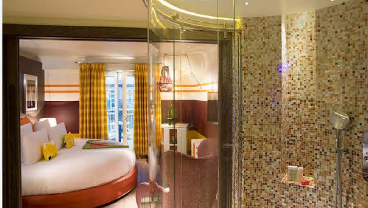
BEDROOM, HOTEL DE PARIS

Anyone who has watched the famous 'Gendarme de St Tropez' movies might recognise this building, set right on the famous seaside resort's harbour-side. The walls that once housed the actual Gendarmerie de St Tropez (featured in the films) now host those wishing to stay in designer style in town! Revamped by the famous Sybille De Margerie, the entire hotel oozes St Tropez chic with a touch of nostalgia. From its restaurant "Le Pationata restaurant" with its cool 70's inspired décor, Paco Rabanne styled metallic chandeliers and five star service to l'Atrium bar where local Brigitte Bardot is honoured.