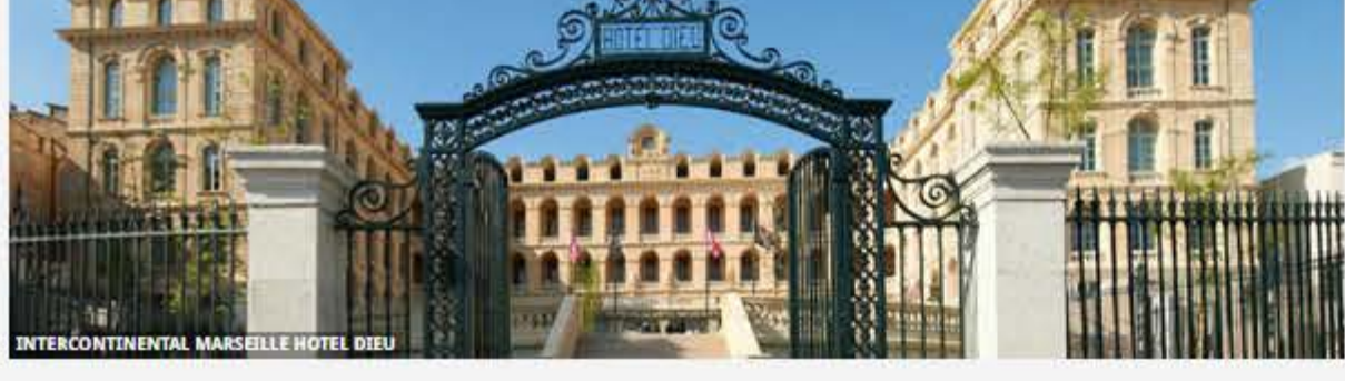
INTERCONTINENTAL MARSEILLE HOTEL DIEU

One of the city's most iconic landmarks, the one-time hospital dating back to the 18th Century has been given a new lease of life as a luxury hotel with hip decor, top-notch service and great views over the Vieux Port and a gourmet restaurant. Retaining plenty of original features, it's been transformed with the utmost taste and style. What's more, it has a sleek Clarins spa in the basement for some serious pampering. There's also an amazing buffet breakfast one can linger over on the huge terrace overlooking the Med. Prefer to linger at twilight? Grab a sunset drink at Le Capian where the mixologist has a reputation for mixing a mean cocktail. With easy access to the metro, buses and the harbour below, it's also perfectly located to explore the old town, the dreamy 'calanques' and the impressive Mucem museum. www.ihg.com/intercontinental/marseille