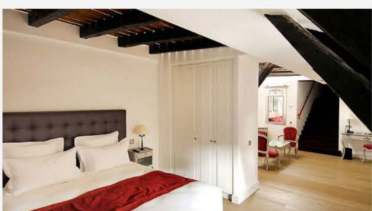
BEDROOM AT THE COUR DU CORBEAU

This 16th-century building, a skip away from the Palais Rohan and the Cathédrale Notre-Dame de Strasbourg blends history and the contemporary perfectly. The oak beams, inside and out, give the Cour du Corbeau authenticity, while the modernised Neo-Baroque furnishings in the rooms, matched with sleek simple taupe and aubergine add certain chic. Dating back to 1528, each room has its own identity while the charming interior cobbled courtyard is just the place to relax with an aperitif. A typical Alsatian inn, the old coaching inn is actually a listed historic monument, and has seen the likes of Frederick II, the King of Prussia, Voltaire and Maréchal de Turenne stay under its roof. They, however, would not have had the benefit of the flat-screen TVs, 24-hour room service, or WiFi... www.mgallery.com