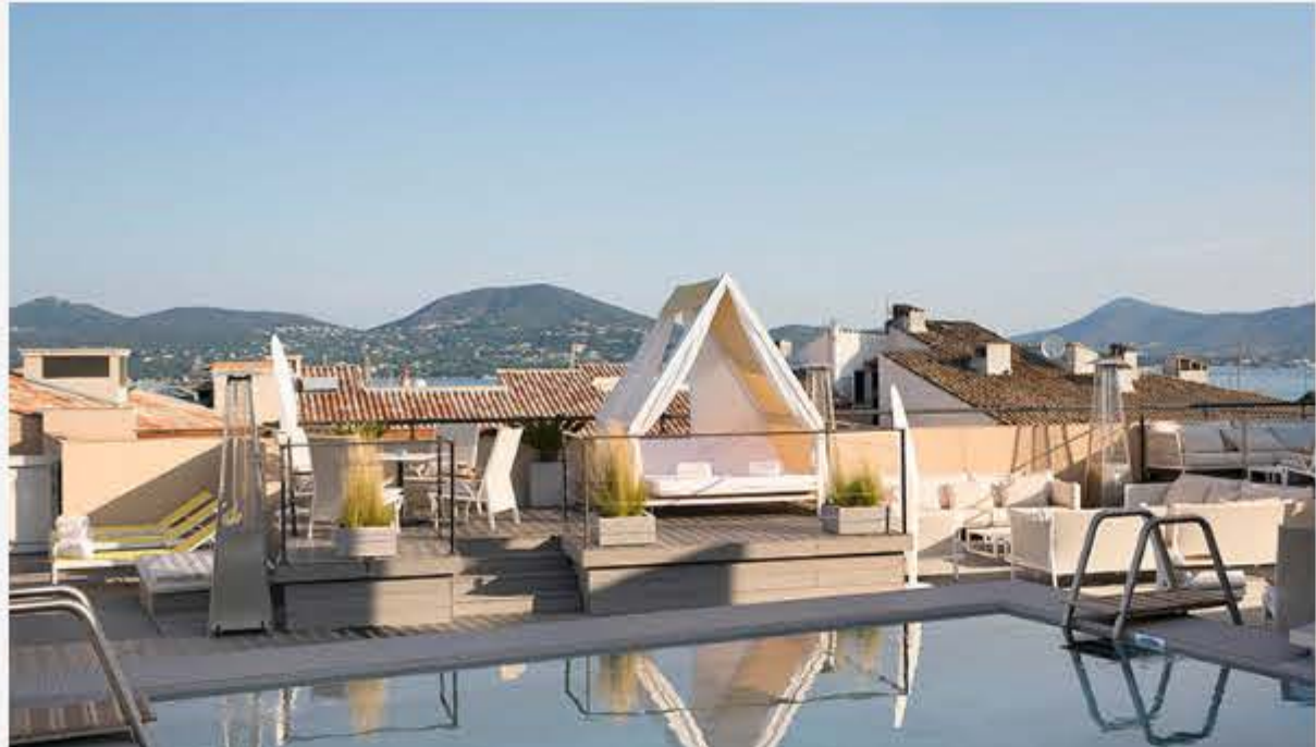
ROOFTOP POOL AT HOTEL DE PARIS

Anyone who has watched the famous 'Gendarme de St Tropez' movies might recognise this building, set right on the famous seaside resort's harbour-side. The walls that once housed the actual Gendarmerie de St Tropez (featured in the films) now host those wishing to stay in designer style in town! Revamped by the famous Sybille De Margerie, the entire hotel oozes St Tropez chic with a touch of nostalgia. From its restaurant "Le Pationata restaurant" with its cool 70's inspired décor, Paco Rabanne styled metallic chandeliers and five star service to l'Atrium bar where local Brigitte Bardot is honoured.