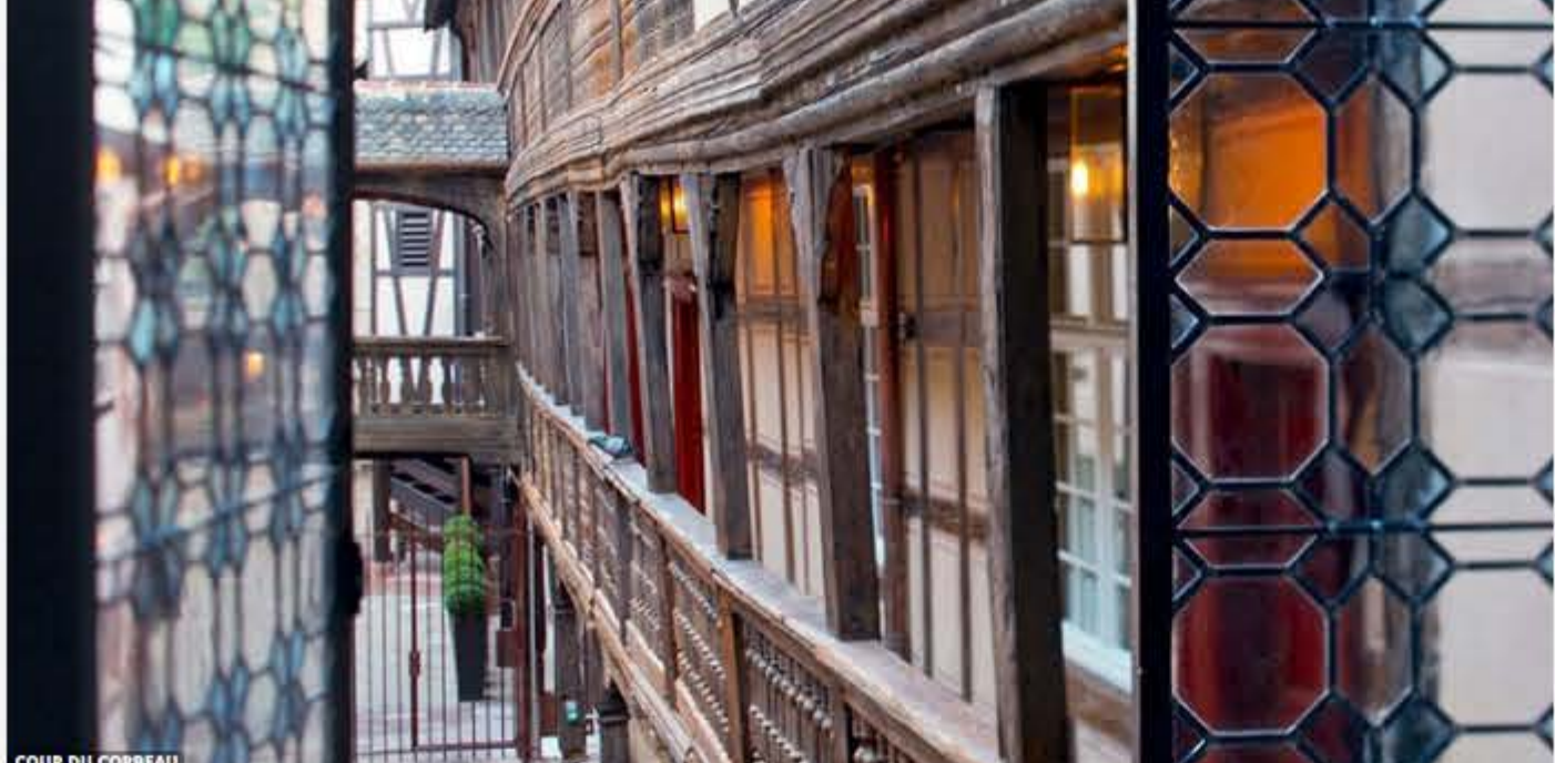
COUR DU CORBEAU