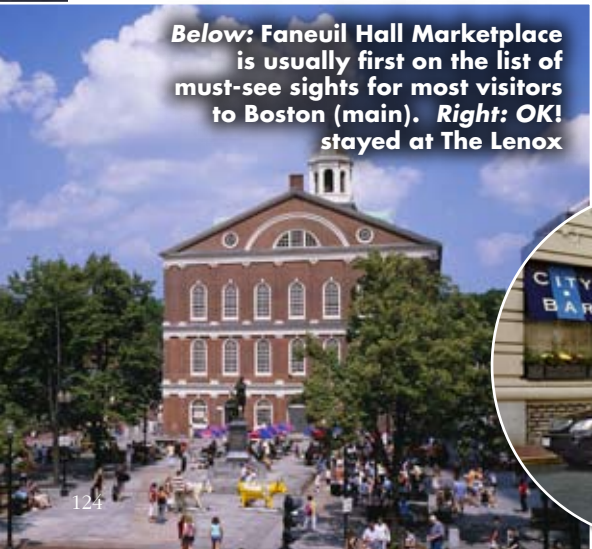
Below: Faneuil Hall Marketplace is usually first on the list of must-see sights for most visitors to Boston (main). Right: OK! stayed at The Lenox

B oston is one of America's oldest cities and one of the few with a truly European feel. There's plenty to see and do, with each neighbourhood having its own attractions and personality. First stop for many visitors is Faneuil Hall Marketplace, a Convent Garden-style pedestrianised marketplace on the waterfront, while Newbury Street in Back Bay is a real shopping mecca. For historic Boston head to Beacon Hill, renowned for its antique stores and period homes, or watch a Red Sox game at Fenway Park, where you might spot avid fans and local boys Ben Affleck and Matt Damon. Foodies will love the North End (Little Italy), trendsters will enjoy hanging out in the cafes and boutiques of South End, while those who wish for an university ambience should head out to Harvard in the leafy suburb of Cambridge. Then try and squeeze in a few lazy days on the beach staying at one of the laid-back seaside communities on Cape Cod.