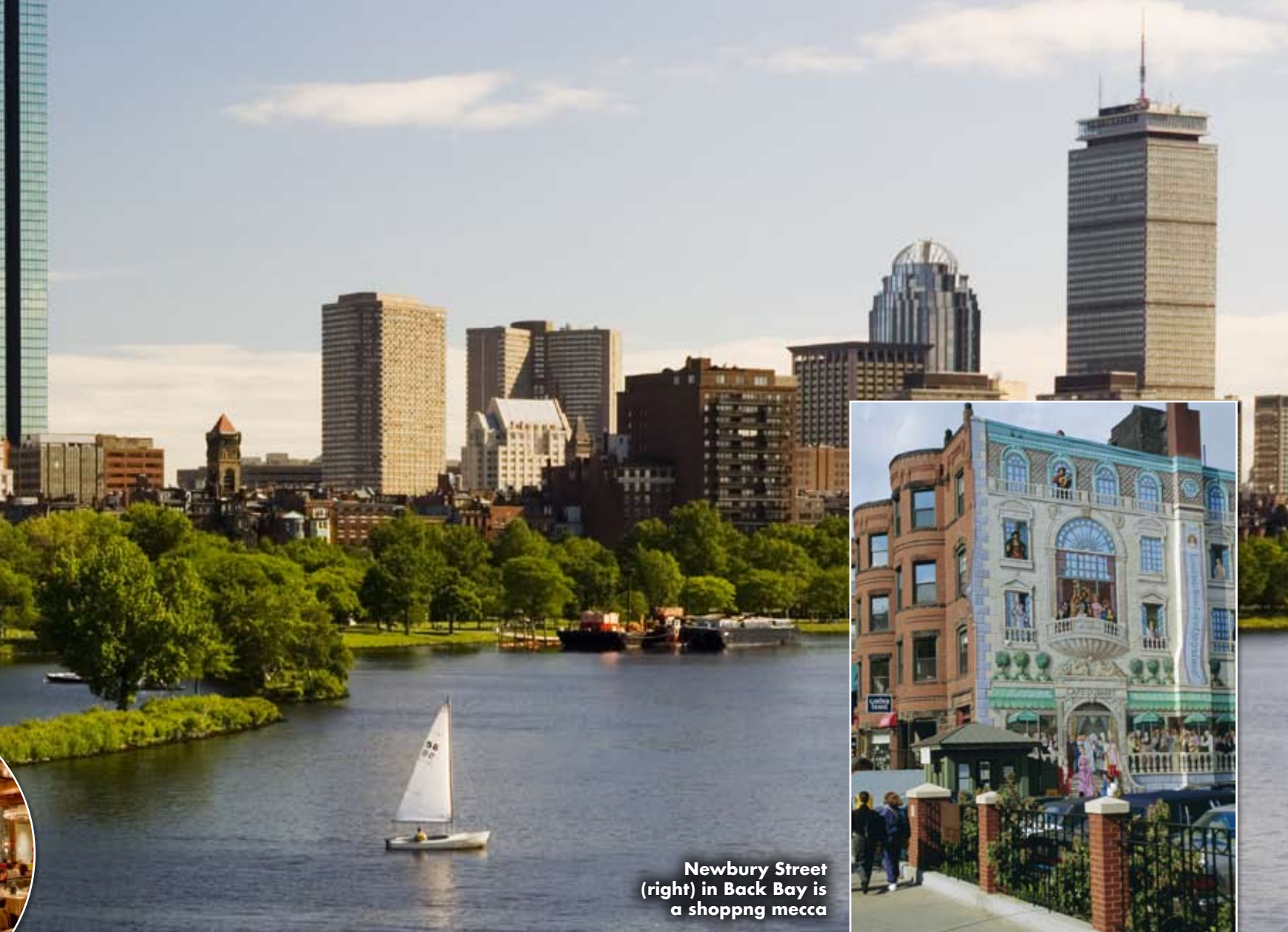
Newbury Street (right) in Back Bay is a shopping mecca