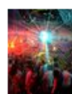
ELLE's Ibiza 2012 Party