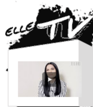
Jessie J: ELLE Twitter Q&A

We asked for your questions and Jessie J