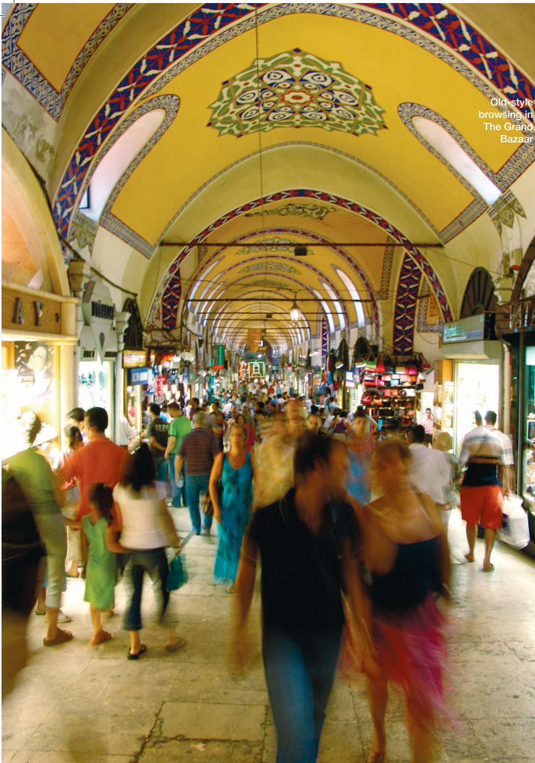
Old-style browsing in The Grand Bazaar