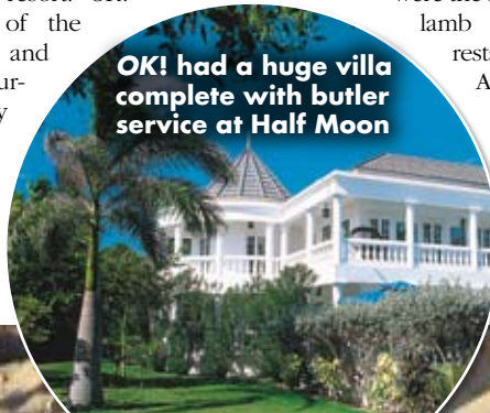
OK! had a huge villa complete with butler service at Half Moon

Stayed in one of the spacious suites and loved our four-poster bed, baby grand piano and huge bathroom complete with walk-in shower and a gigantic bathtub.