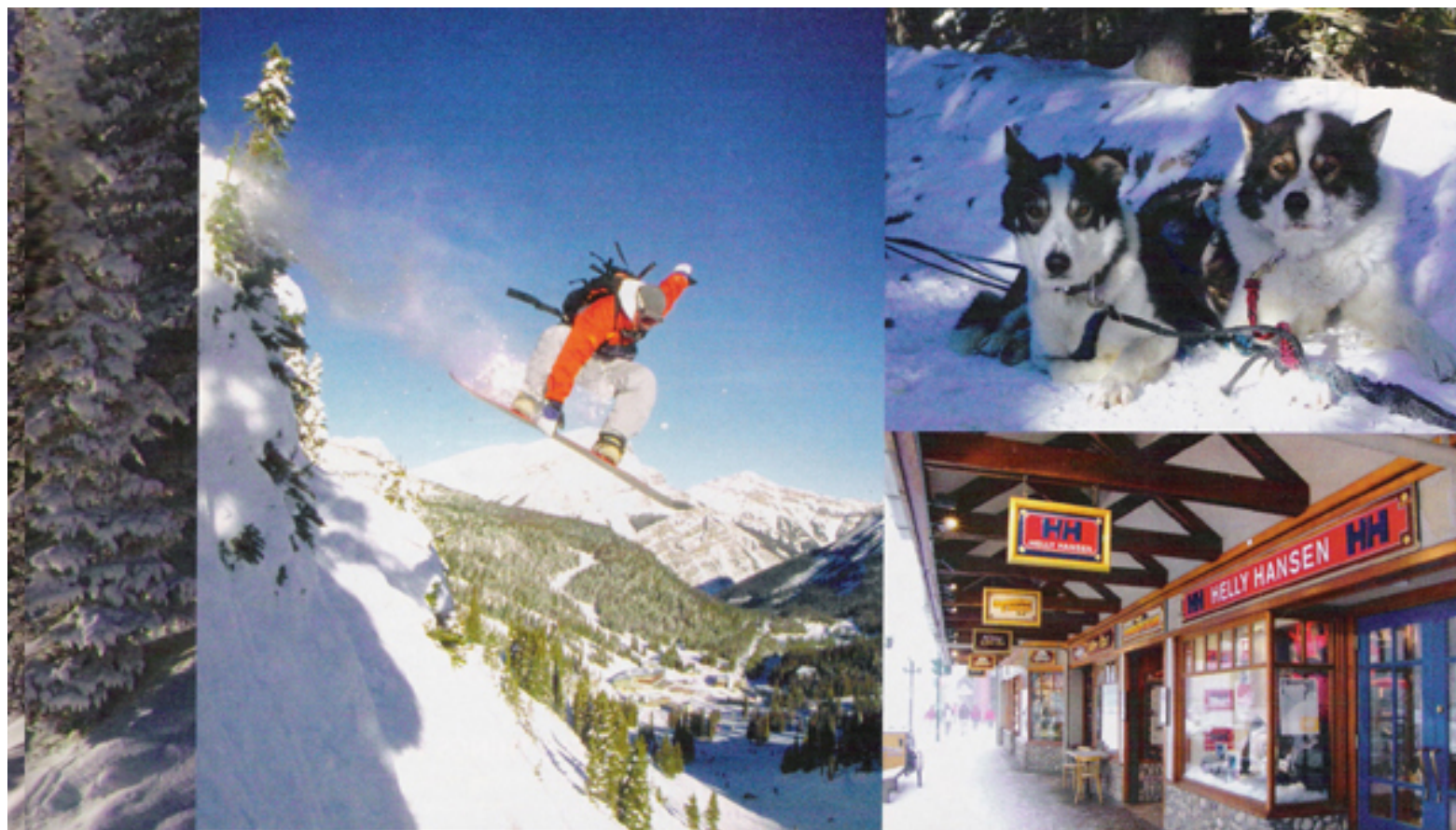
CLOCKWISE FROM ABOVE The resort caters for all levels of skiers, from nervous beginners to acrobatic snowboarders; Fluffy husky dogs are right at home in the sub-zero temperatures; Take a break from the slopes and hit the shops for a spot of retail therapy; Snow-laden fir trees line the rocky peaks; Breathtaking scenery in the National Park