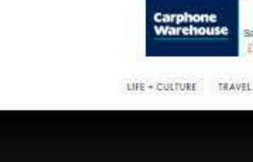
THIS COMPANY IS TRAVELING A BRAND AMBASSADOR TO TRAVEL AROUND EUROPE AND TAKE PHOTOS FOR INSTAGRAM