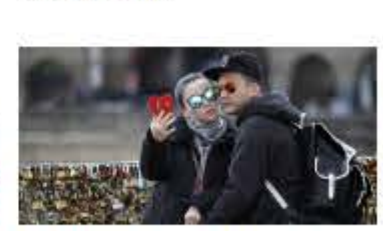
SIX THINGS TO DO IN LONDON THIS WEEKEND: 17.19 FEB