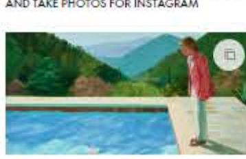
SEVEN THINGS TO DO IN LONDON THIS WEEKEND: FEB 24 - 26