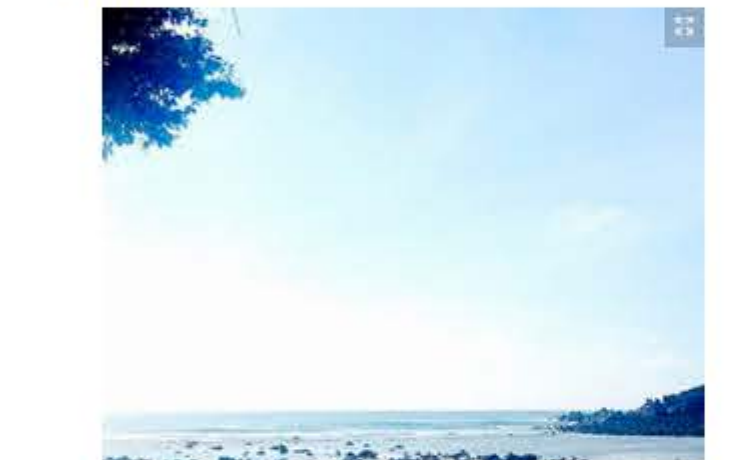
1. St Regis Punta Mita