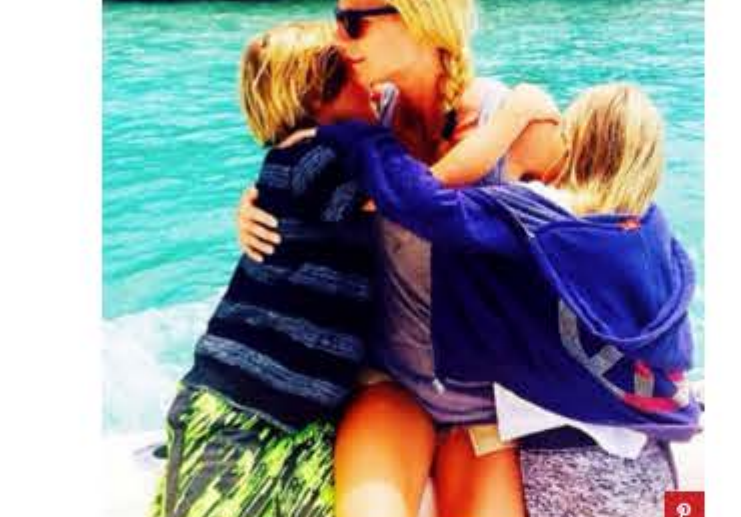
Instagram Gwyneth Paltrow

Want a peek at Gwyneth's favourite holiday hideaways?