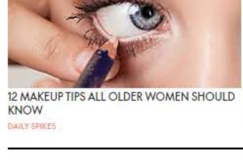
12 MAKEUP TIPS ALL OLDER WOMEN SHOULD KNOW