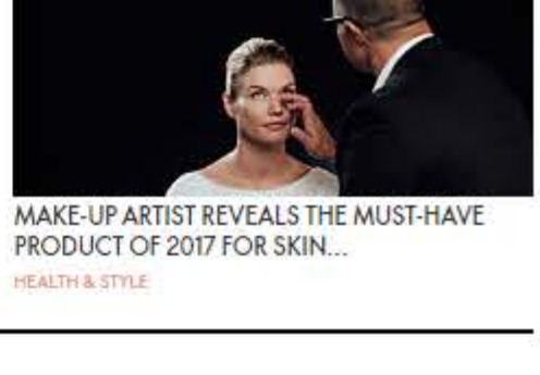
MAKE-UP ARTIST REVEALS THE MUST-HAVE PRODUCT OF 2017 FOR SKIN...