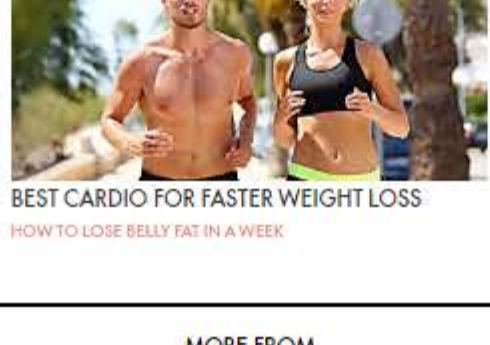
BEST CARDIO FOR FASTER WEIGHT LOSS